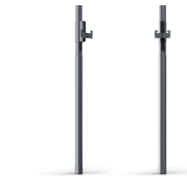
Loewe floor2ceiling stand