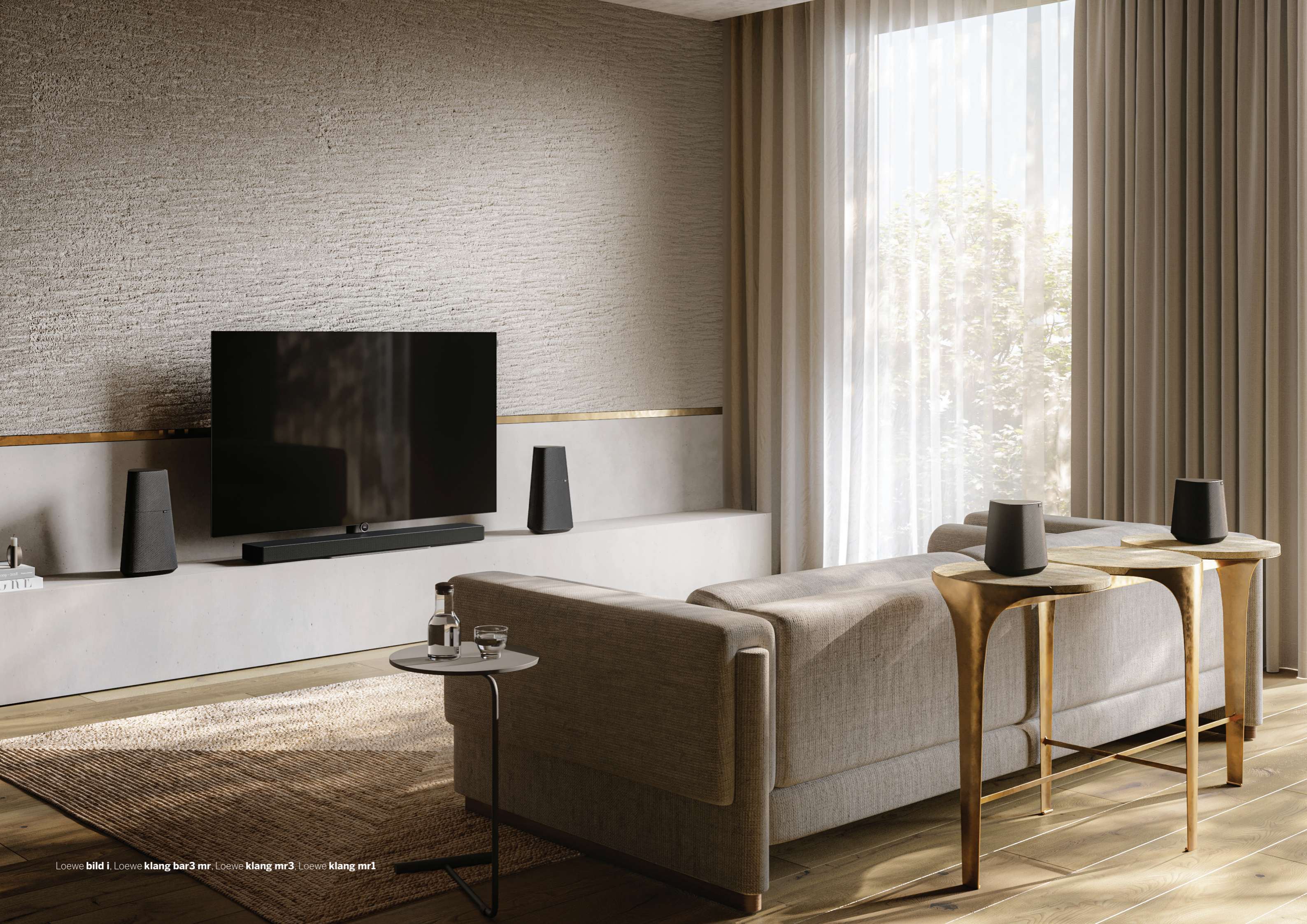
Loewe bild i, Loewe klang bar3 mr, Loewe klang mr3, Loewe klang mr1