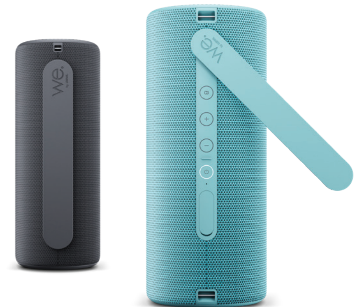
We. HEAR 1

Bluetooth speakers for use at home or on the move. The two speakers We. HEAR 1 and We. HEAR 2, in a clever design and the four fresh colour options Aqua Blue, Coral Red, Cool Grey and Storm Grey. The colour coordination goes beyond the different materials and impresses with great attention to detail. The clear design language is emphasised by the high-quality acoustic fabric, which is also suitable for outdoor use thanks to its IPX6 splash protection. With up to 17 hours of battery life, your favourite playlist can run up and down for hours. If you want to benefit from double the music enjoyment, you can connect the two speakers together wirelessly in party mode.