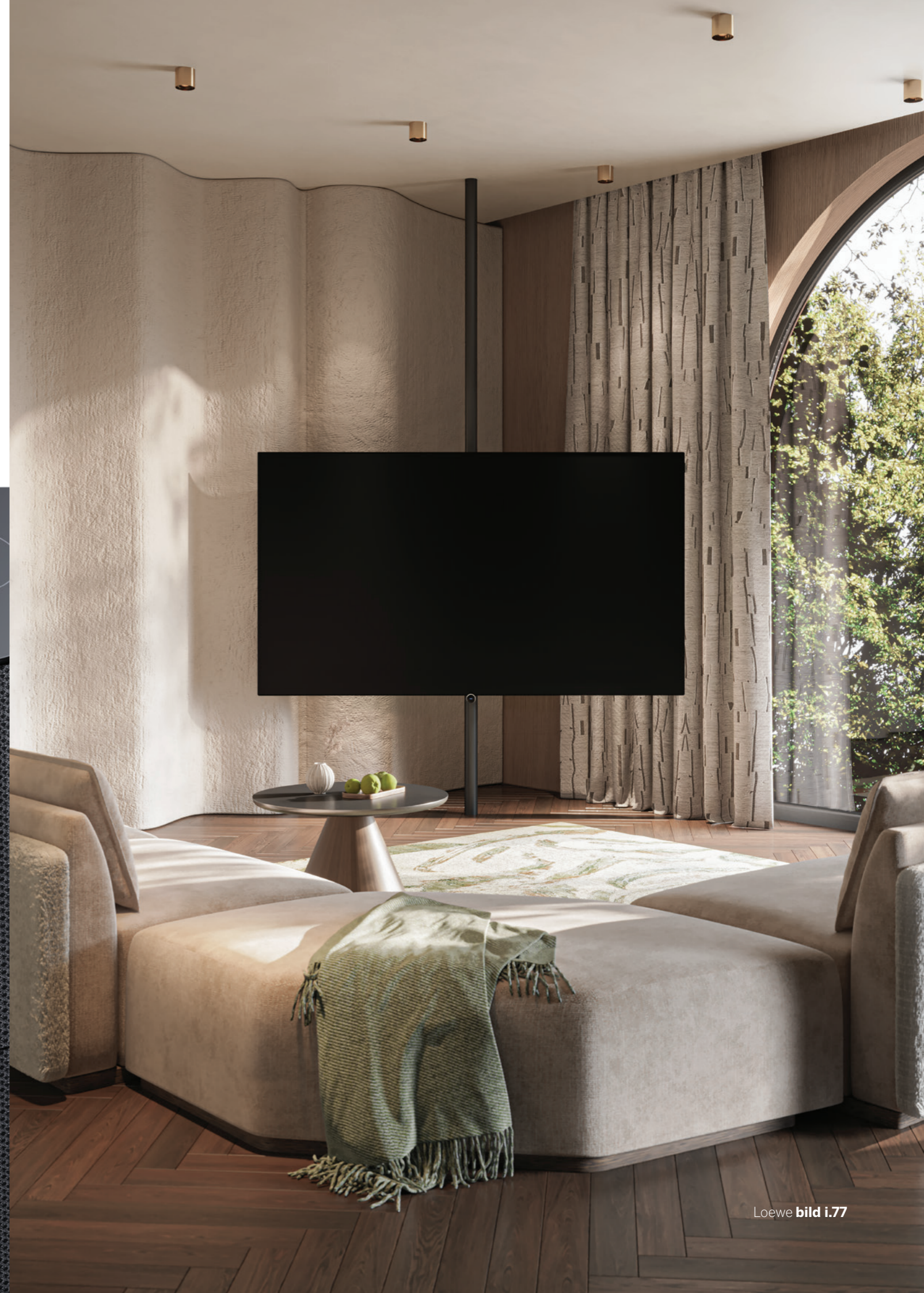
Loewe bild i.77