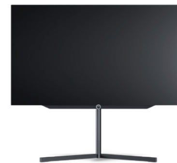
Loewe floor stand motor s.77