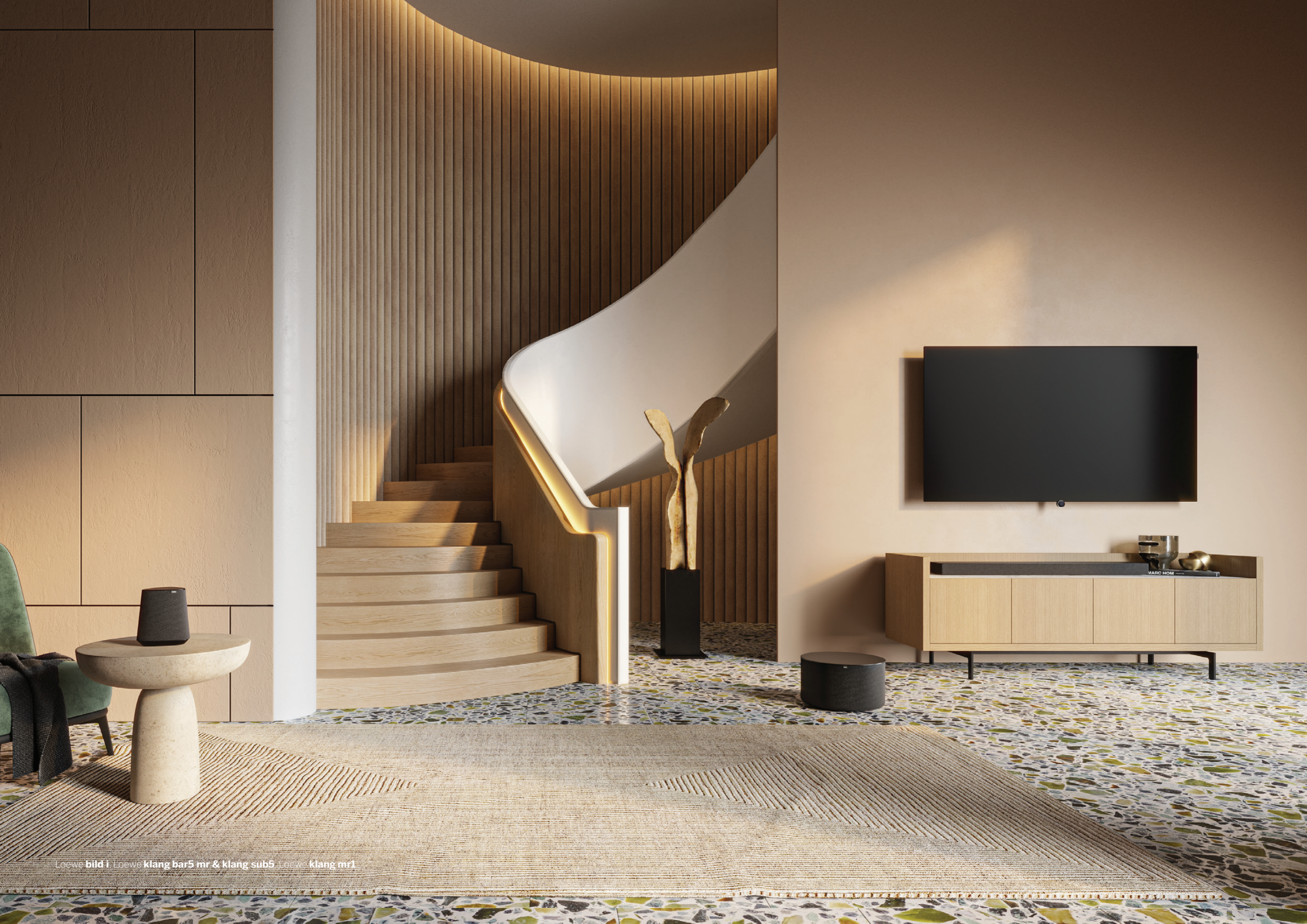
Loewe bild 1, Loewe klang bar5 mr & klang sub5, Loewe klang mrl