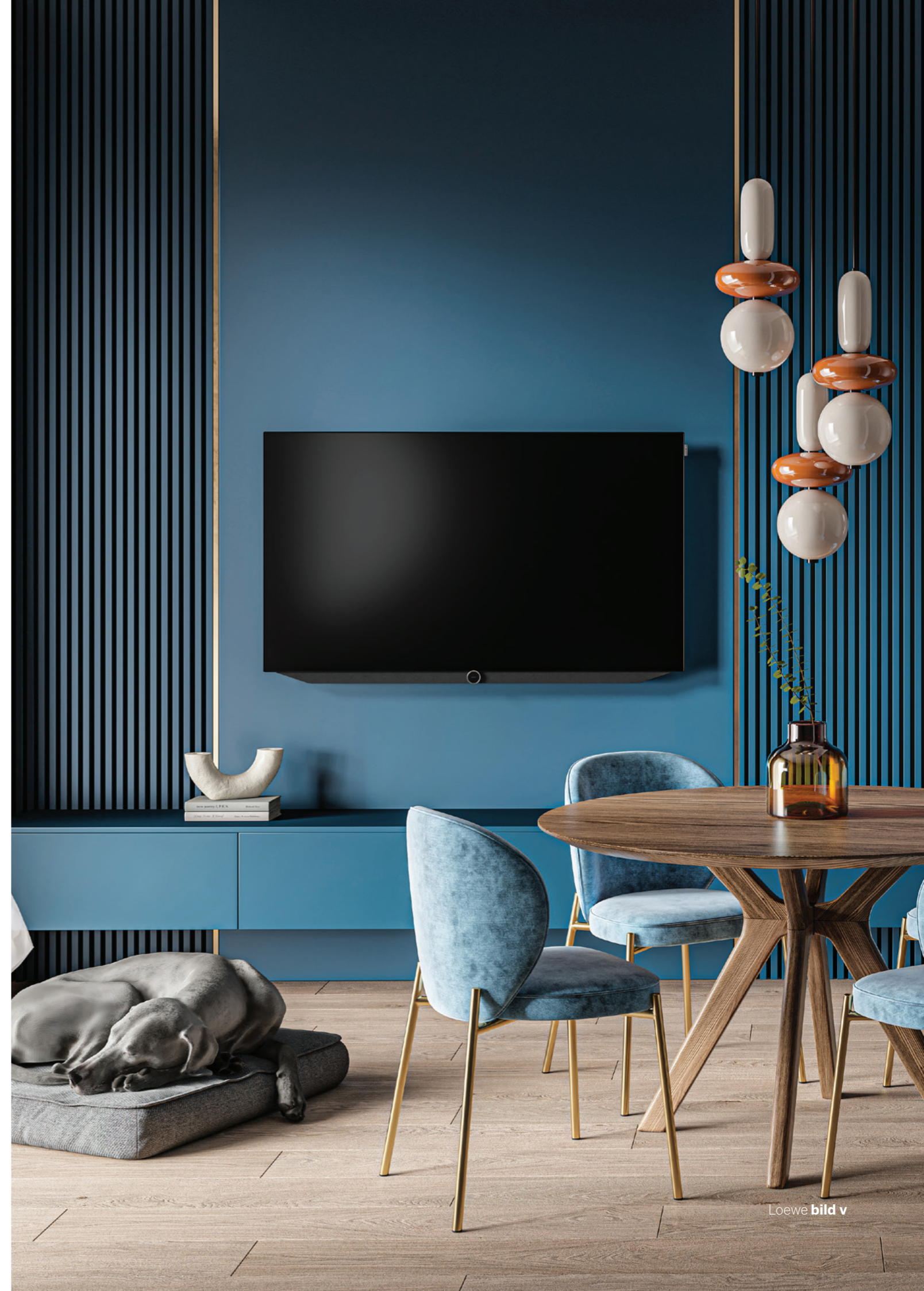
Loewe bild v